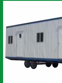
Easy to Move