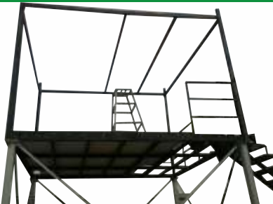
Sturdy MS / Steel Structure